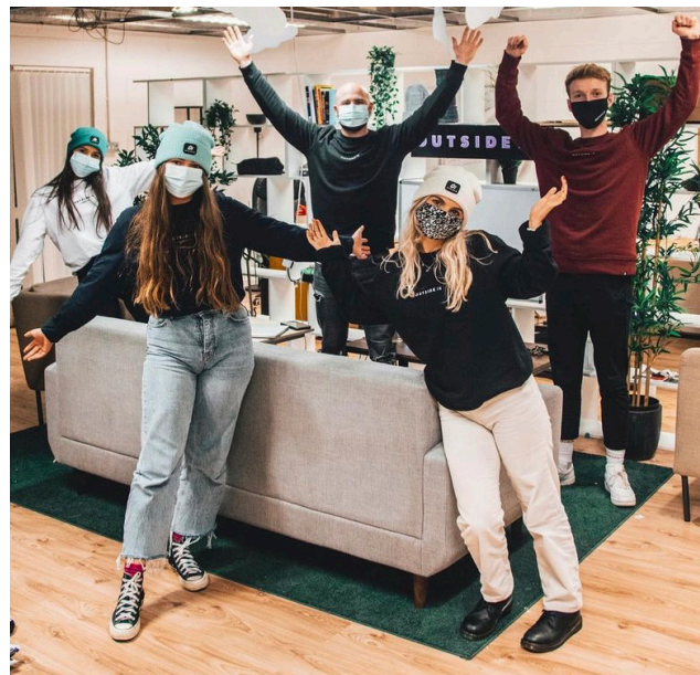
OutsideIn team modelling their Giving Products at the Oi HQ

It is fantastic working with OutsideIn, we have been overwhelmed by their energy, passion and commitment to supporting our work and helping to bridge the gap between society and people facing homelessness. We are working on some exciting plans for new projects together in 2021.